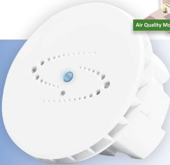
HALO Smart Sensor is Patented.