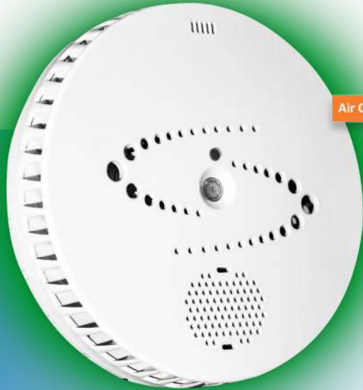
HALO Smart Sensor is Multi-Patented and Design is Trademarked